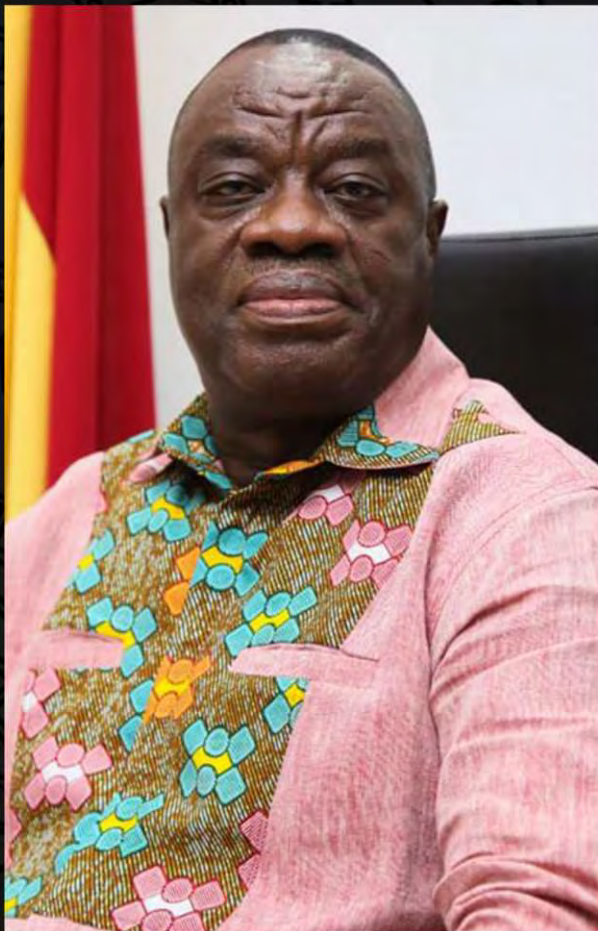
HON. DR. IBRAHIM MOHAMMED AWAL

MINISTER OF TOURISM ARTS AND CULTURE GHANA